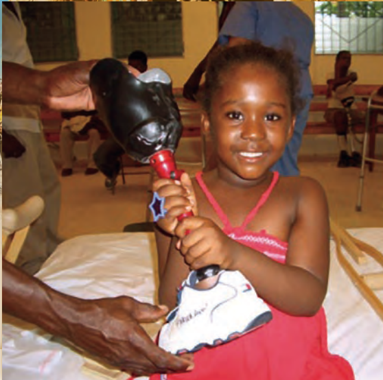
Haitian child smiles knowing she can walk again with the help of a new leg.

to run and play soccer again. Better yet, he has found something more important in his life than soccer—the love of Jesus.