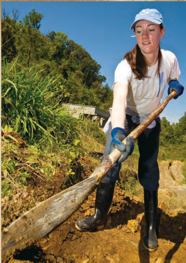
Volunteers help dig trenches (left) to carry a water pipe (above) that will ensure children in Guatemala have safe water to drink (below).